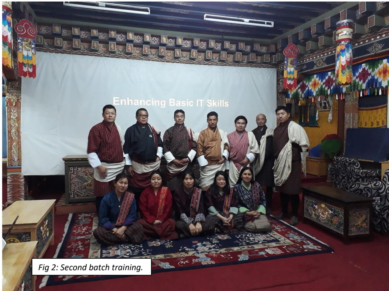
Fig 2: Second batch training.

Second batch of training was conducted on 15 th April at Dzongkhag Tshogdu hall. Participants were from eight geogs (Gups and Geog Administrative Officers). The list of participants is in annex 2.